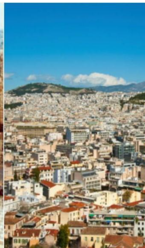
Under the auspices of: