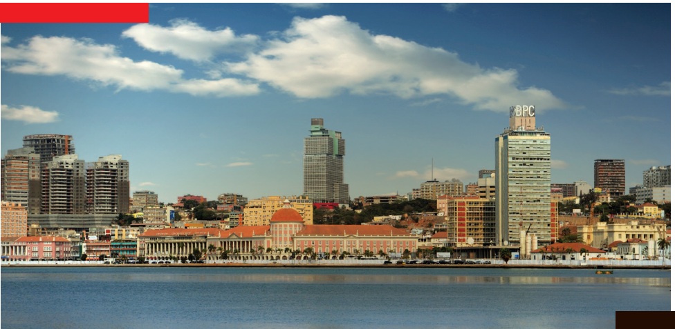
Luanda bay, Angola

These characteristics mean Angola is an excellent place to invest.