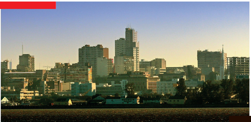
Maputo bay, Mozambique

These characteristics mean Mozambique is an excellent place to invest.