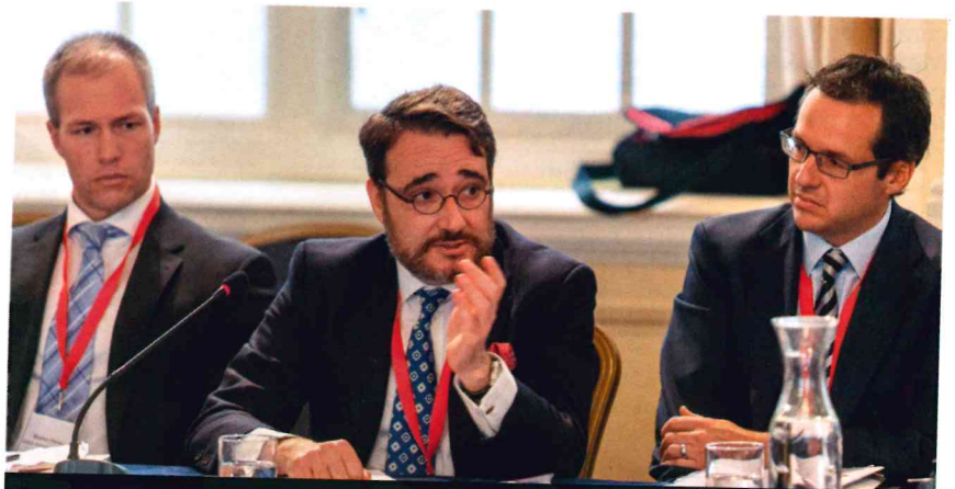
Participants discussed the need for infrastructure investment in Lusophone Africa